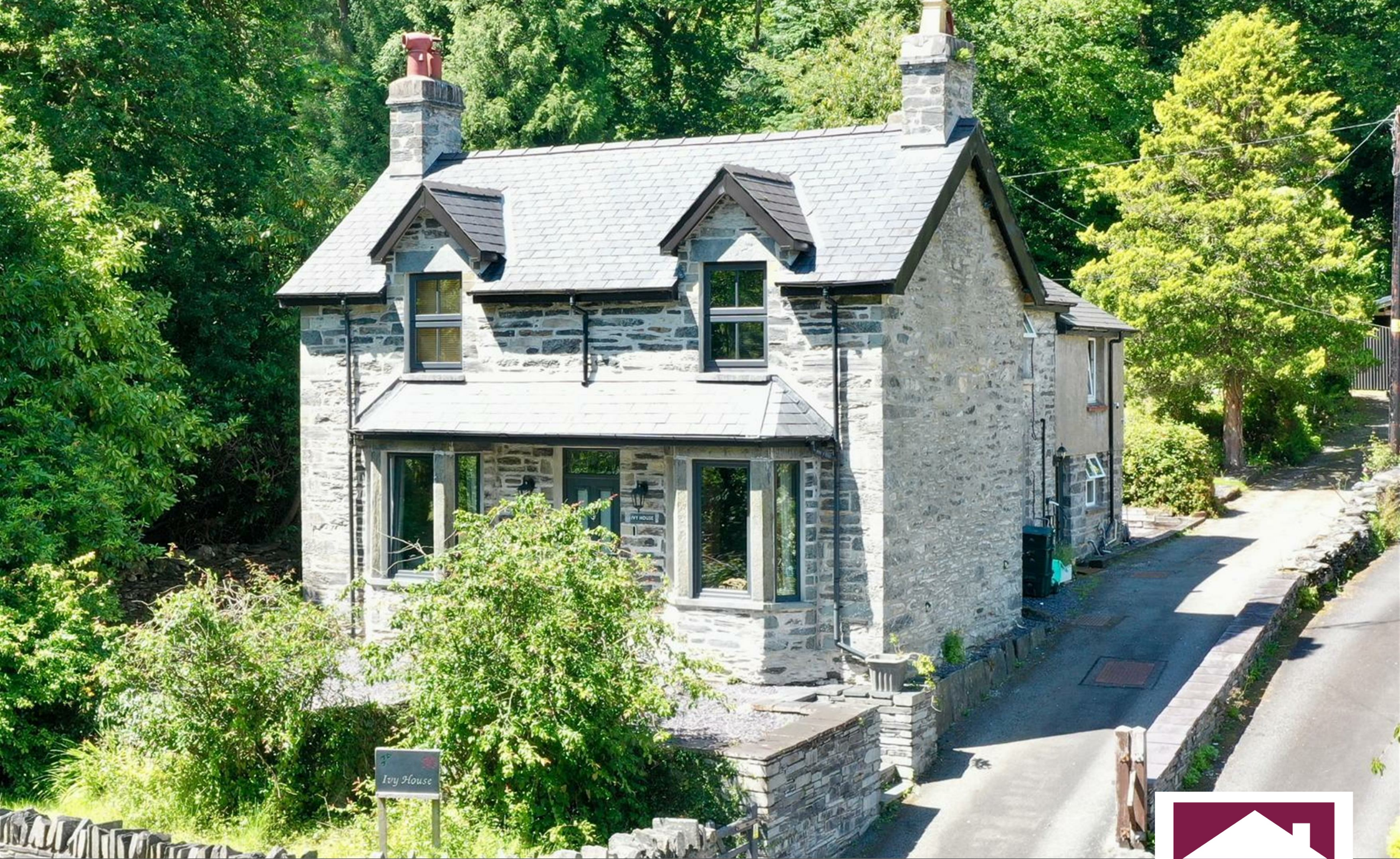
Ivy House, Betws Y Coed LL24 0SN